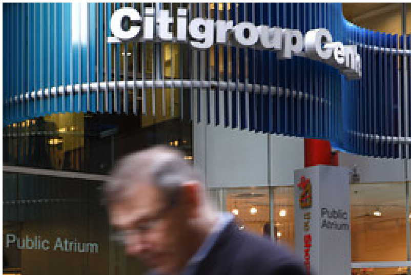
A pedestrian walks past the Citigroup Center in New York.

Over the past several days, Treasury Secretary Timothy Geithner and other government officials discussed whether to require the removal of Citigroup Chief Executive Vikram Pandit, according to a person familiar with the discussions. But government officials concluded it was impractical to oust him, partly because of a lack of strong potential successors. A boardroom shake-up already is in motion, largely due to pressure from the Fed.